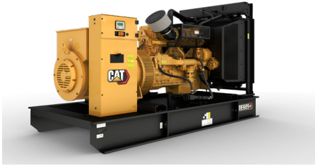
Image shown might not reflect actual configuration