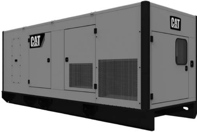
Picture shown may not reflect actual package.